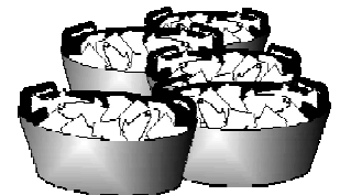
The Fragments Filled 12 Baskets

This is an Opportunity to Make Your Voice Heard As the MMG Grows. Help us Form Our Vision for the Future. All are invited to participate